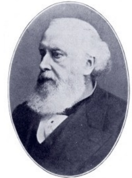
William H. Monk