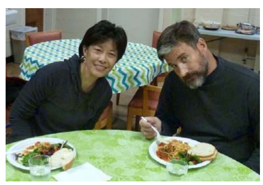
The St. John's community shared spaghetti, salad, and fellowship at the April 25 spaghetti supper.