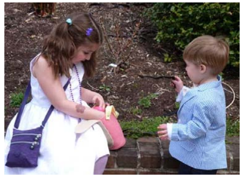
Bright smiles and stylish outfits on display at the St. John's Easter egg hunt on April 5.