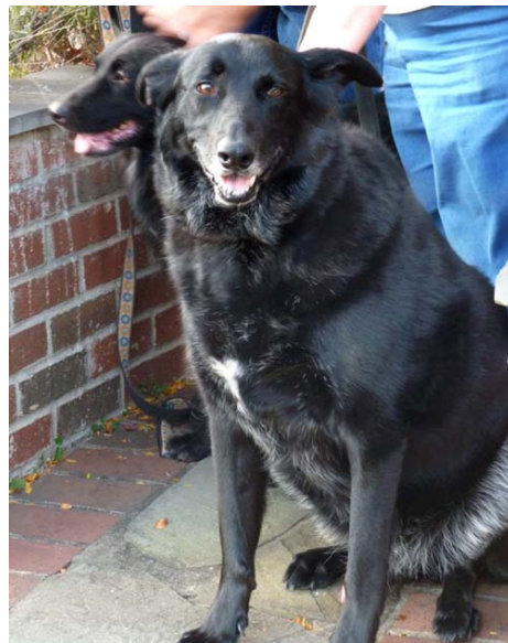
Enthusiastic participants in past animal blessings at St. John's.