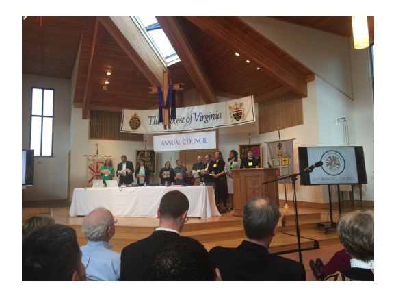
The Diocese of Virginia's 221st annual council was held March 5 in Herndon.

Because it was a shortened council, attendees did not have a chance to hear from the diocese's partners from South Africa, but their presentations were posted on the diocesan web site. То watch the presentations, visit www.thediocese.net/ Governance/AnnualCouncil/221st-Annual-Council-2016-/Christ-the-King-Video-Series/.